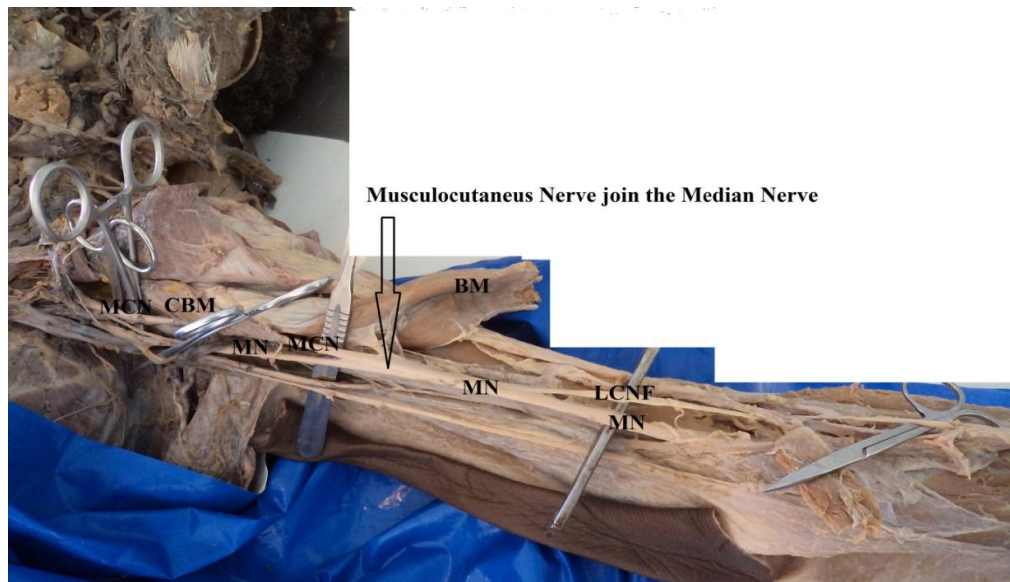
Fig. 1. Cadaver (1) shows a variation that the left musculocutaneous nerve (MCN) has join the median nerve (MN) at the upper part of the arm, after the MCN piercing the coracobrachialis (CBM) under cover of the biceps brachii (BM). The lateral cutaneous nerve of the forearm (LCNF) present as a branch from median nerve