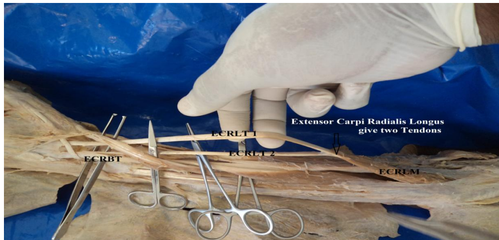
Fig. 2. Cadaver (2) shows that the extensor carpi radialis longus has two tendons, the main tendon (ECRLT 1) inserted into the base of the second metacarpal bone, the additional tendon (ECRLT 2) inserted in common with extensor carpi radialis brevis (ECRB) in the base of the second metacarpal bone

pass through the MCN nerve and join the MN in the middle of the arm, whereas in type III, the lateral root fibers of the MN pass along the MCN and after some distance, leave it to form the lateral root of the MN. In type IV, the MCN fibers join the lateral root of the MN and after some distance, the MCN originates from the MN. In type V, the MCN is completely absent and its