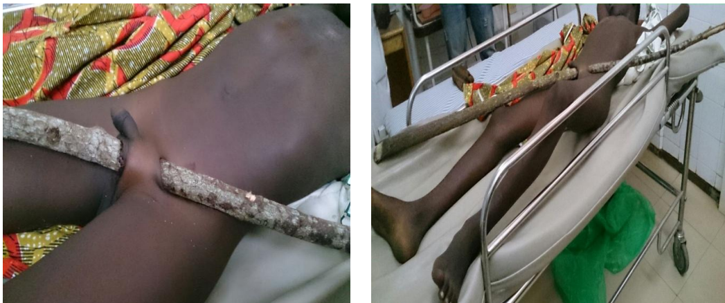
Fig. 1. Patient lying in bed with a long stick in the left hemiscrotum

Patient was haemodynamically stable with BP-110/70mmHg, Pulse-120 bpm, RR-24 cpm, T-36.2 °C, SpO 2 -100% on room air. He was not pale, anicteric and not in any obvious respiratory distress. His chest was clinically clear although he had some abrasions on the anterior chest wall. Abdomen was soft, mild tenderness in left groin and no palpable organomegaly. Focused assessment with sonography in trauma (FAST) was negative, no pelvic girdle tenderness.