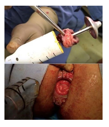
Fig. 4. Complete "donut" of tissue removed with stapler (above). The suture-line is inspected at the end of the procedure

sutures. In patients with significant mucosal prolapse, mucopexy was also done using 2-0 vicryl at 2, 4, 8 and 10 o'clock. The anal canal was packed using a lubricated rolled up gauze and kept for 4-6 hours. The patient is then shifted to recovery and in the absence of any events, discharged the next day.