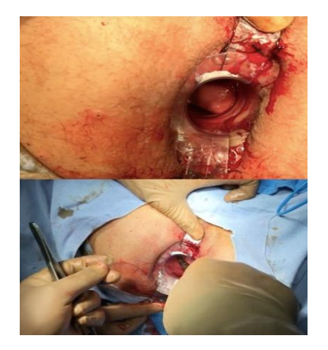
Fig. 2. Introduction of side viewing anoscope (above) followed by purse-string suture placement

The anvil of the fully opened stapler is then inserted across the anus and through the pursestring suture. The purse-string suture is then fully tightened and tied around the shaft of the stapler. Then three maneuvers are performed at the same time: gentle traction on the suture, tightening of the stapler head and advancing the stapler into the rectum. When fully tightened, the 4-cm mark on the stapler should be at the anal verge. The vagina is examined in females to confirm that the posterior vaginal wall is not incorporated into the suture. The stapler is then fired and held closed for 1 minute to achieve hemostasis.