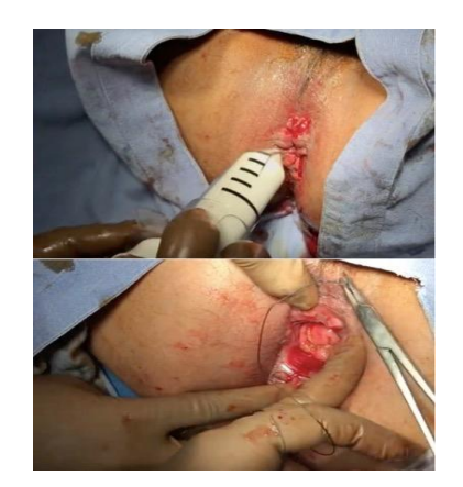
Fig. 1. Introducing the obturator (above) and fixation of the anoscope to the perianal skin (below) during stapler hemorrhoidopexy

Stapler Hemorrhoidopexy was performed by using a specifically-designed 3 rows circular stapling device, MIRUS™ Hemorrhoids Stapler by Meril Endo-Surgery Pvt. Ltd. The operation was performed in the standard extended position. Preoperative lithotomv purgation was not done. Under spinal anesthesia, after painting and draping the operative field, the anus is progressively dilated to accommodate the side viewing anoscope (external diameter 34-36 mm). After dilatation, the circular anoscope and obturator are inserted into the rectum.