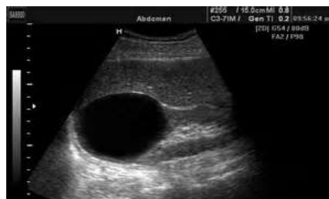
Figure 3. Shows the simple cortical renal cyst.

mass or mixed findings with the p value = 0.34.