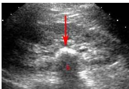
Figure 4. Sonographic image showing renal stone.