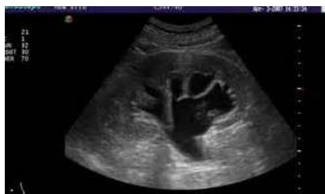
Figure 5. This shows hydronephrosis of the kidney.