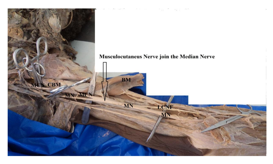
Fig. 1. Cadaver (1) shows a variation that the left musculocutaneus nerve (MCN) has join the median nerve (MN) at the upper part of the arm, after the MCN piercing the coracobrachialis (CBM) under cover of the biceps brachii (BM). The lateral cutaneus nerve of the forearm (LCNF) present as a branch from median nerve