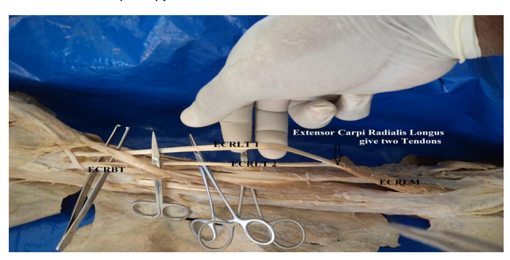
Fig. 2. Cadaver (2) shows that the extensor carpi radialis longus has two tendons, the main tendon (ECRLT 1) inserted into the base of the second metacarpal bone, the additional tendon (ECRLT 2) inserted in common with extensor carpi radialis brevis (ECRB) in the base of the second metacarpal bone

pass through the MCN nerve and join the MN in the middle of the arm, whereas in type III, the lateral root fibers of the MN pass along the MCN and after some distance, leave it to form the lateral root of the MN. In type IV, the MCN fibers join the lateral root of the MN and after some distance, the MCN originates from the MN. In type V, the MCN is completely absent and its